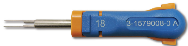
Tool in ready mode with retracted protective cover.