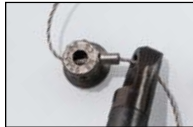
Step 2 - Insert

A cable assembly is threaded through the fasteners in a direction that exerts a positive pull on the fastener when tension is applied.