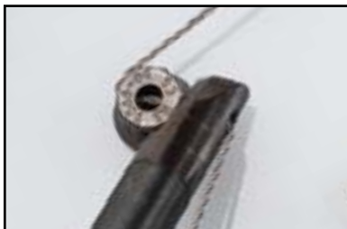
Step 3 Tension

Simply thread the cable through the ferrule and the tool nose.