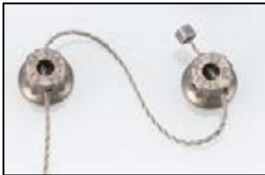
Step 1 - Thread

A cable assembly is threaded through the fasteners in a direction that exerts a positive pull on the fastener when tension is applied.