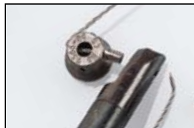
Step 4 - Crimp & Cut

The ferrule is firmly crimped and the cable is cut flush with the end of the ferrule.