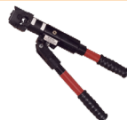
#8-#2 AWG SOLISTRAND crimp tool (no crimp dies required) PN 59975-1 / IS 408-6758