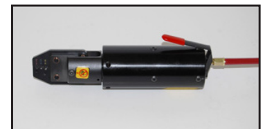
PMT232 Pneumatic Tool

DANIELS MANUFACTURING CORP., 526 THORPE ROAD, ORLANDO, FL 32824, USA PHONE (407) 855-6161 • FAX (407) 855-6884 • www.DMCTools.com • E-MAIL: DMC@DMCTools.com