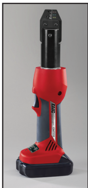
GMTEB232 Battery Tool

Battery and Pneumatic Powered Versions are Available!