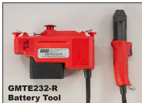
GMTE232-R Battery Tool